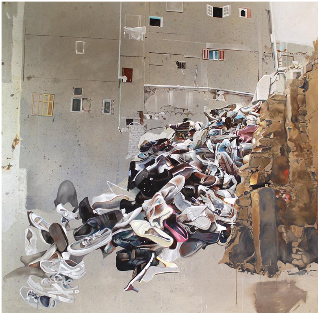
Descent, 2015, Oil and Acrylic on canvas, 72 x 72 inches

"This image is based on a photo I took in Cairo, near where I was working. This is a typical sight to see in the city, an area where a building has fallen down and has been converted into an ad hoc dump. I'm interested in garbage because in America our garbage disappears, we tend not to see the results of our habits of consumption, while in other places it might stay around, your poor shopping decision or the bag it came in. The composition is a deposition, such as the one by Rembrandt, where the body of Christ is removed from the cross. The pile of shoes seems to come from above and is somehow a stand-in for a body or a sacrifice". [Rebecca Bird]