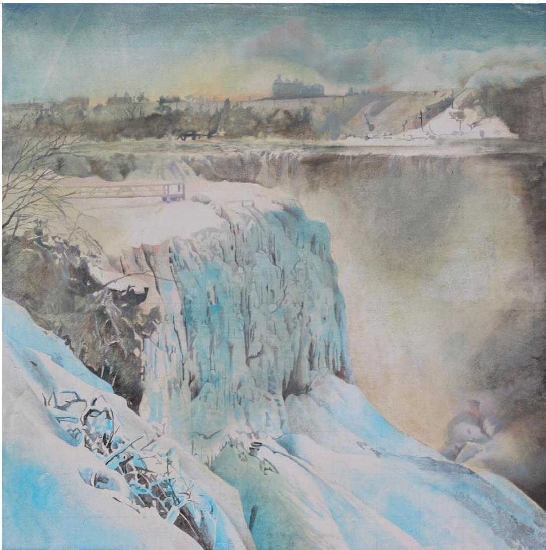
Frozen Falls, 2014, Acrylic and oil on wood, 16 x 16 inches