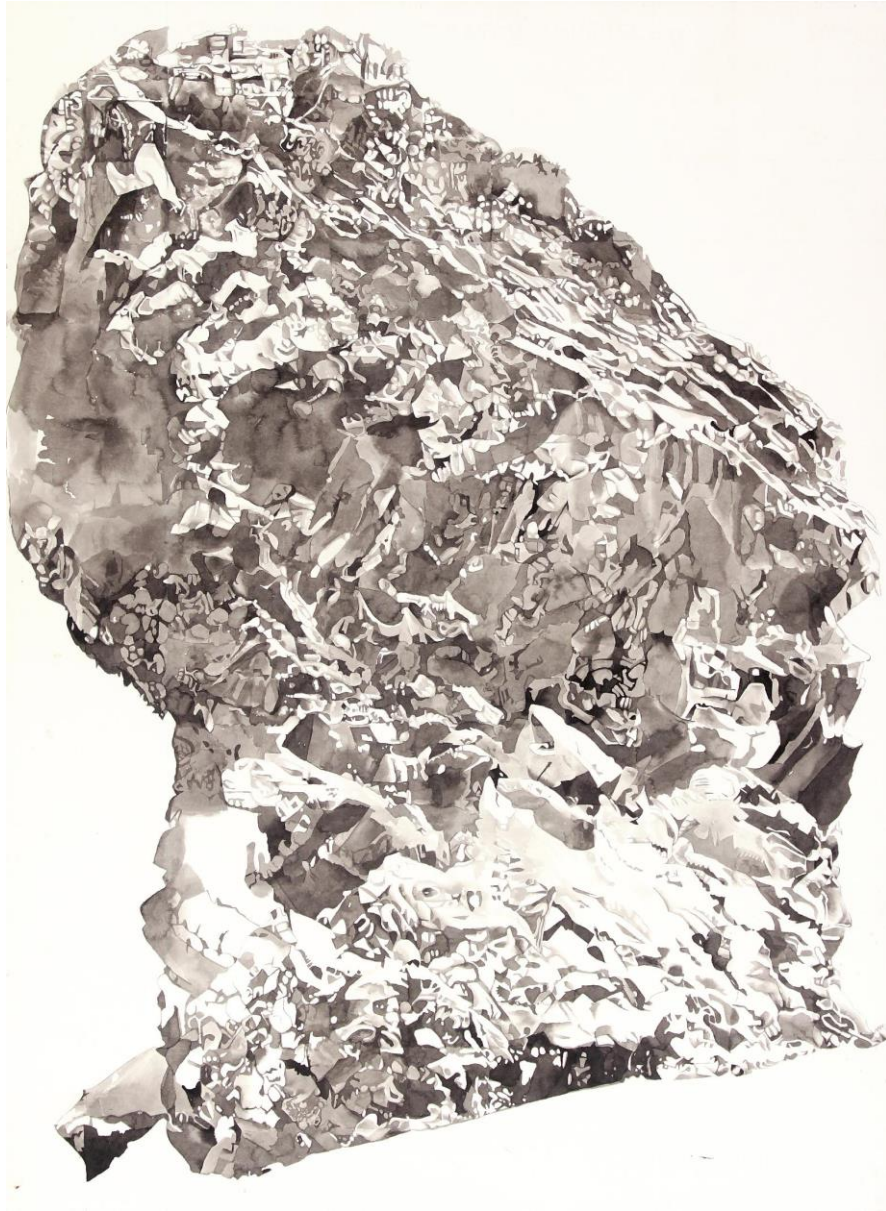
Boulder, 2013, Ink on paper, 30 x 22 inches