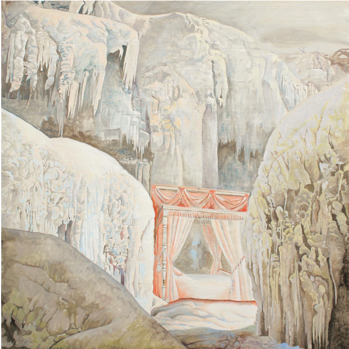
So White, 2011, Oil on panel, 16 x 16 inches