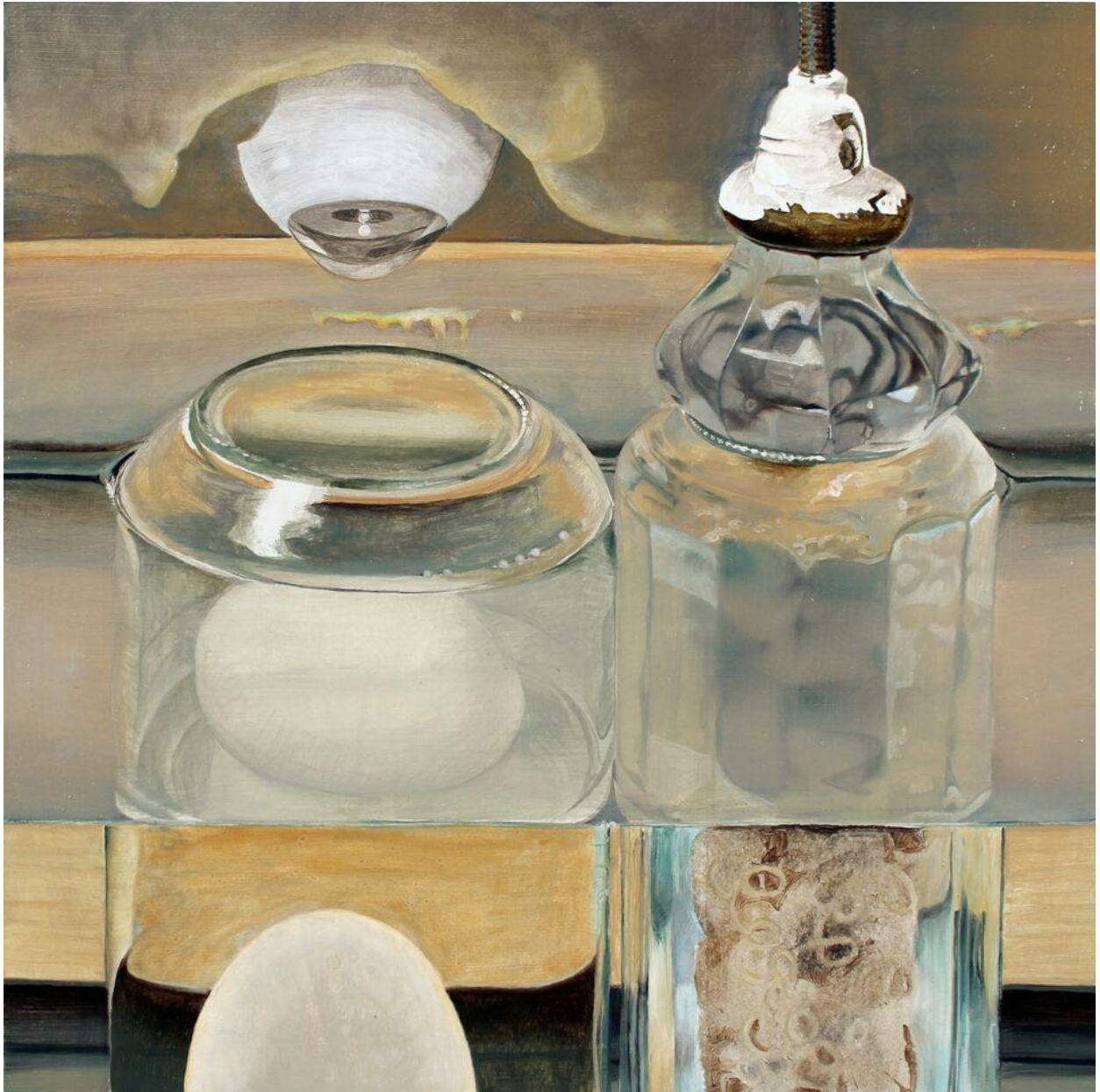
Seeing, 2011, acrylic and oil on wood, 12 x 12 inches