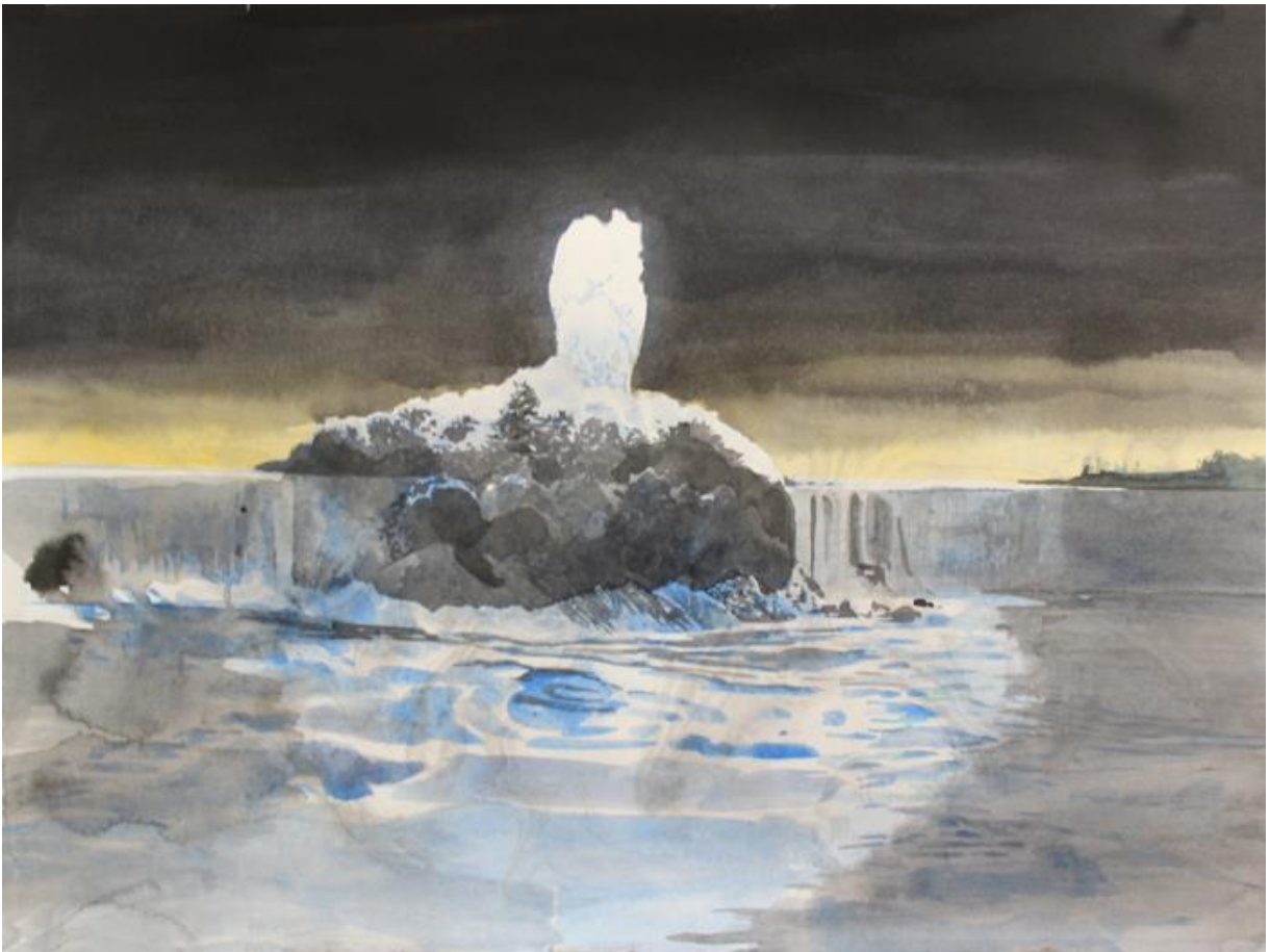
Falls, 2014, watercolor on paper, 17 x 21 inches

“Several of my works center on imagery of Niagara Falls as a locus of romance and risk in my childhood imagination. This image becomes a window into expectations for my adult life that I absorbed as a female child- either the dream honeymoon or a ride over the falls in a barrel. The idea of this place, which I had never seen but was familiar with nonetheless, contained a coded message of the precariousness of my situation – that things could go perfectly well or terrifyingly wrong. Niagara Falls is both a sentimental domesticated notion of the beauty of nature and a violent uncontrollable force; as such it is an apt metaphor for the rites of passage that lead to adult womanhood - often marriage or sex.” [Rebecca Bird]