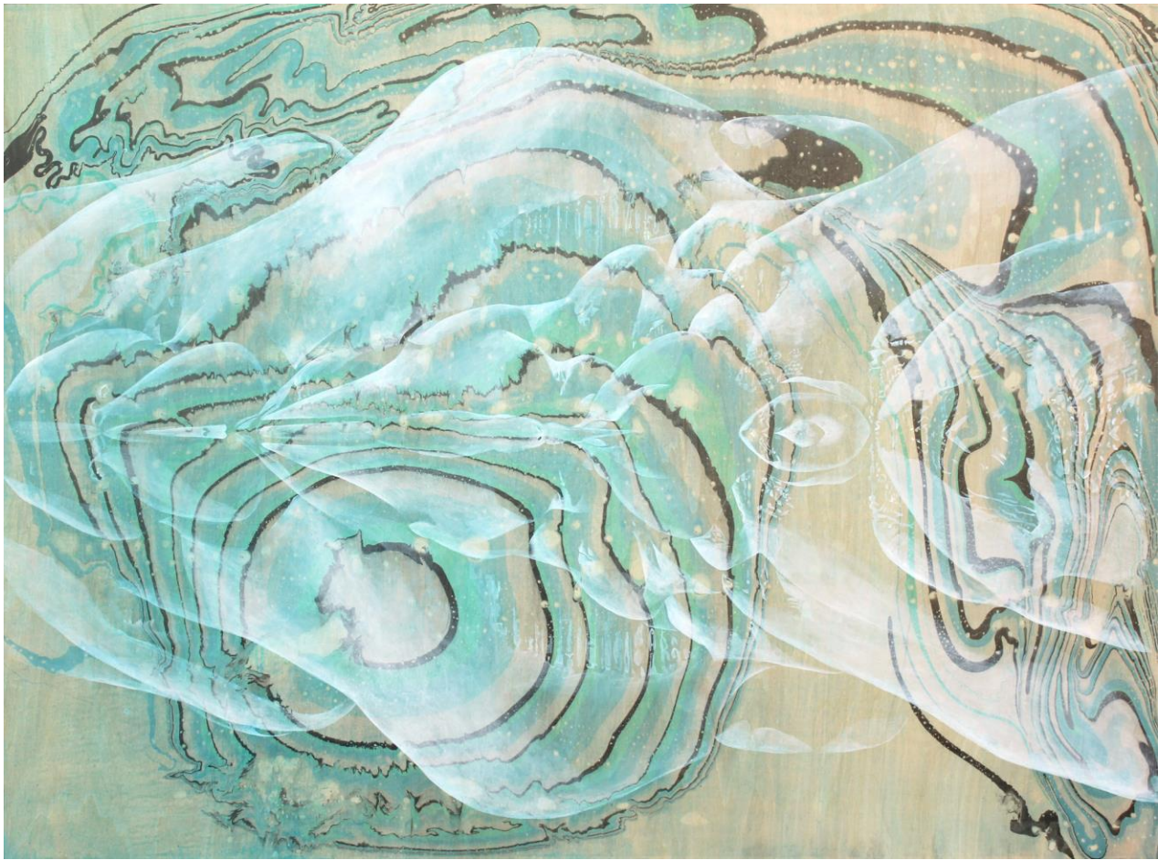
East, 2014, Acrylic on panel, 30 x 40 inches