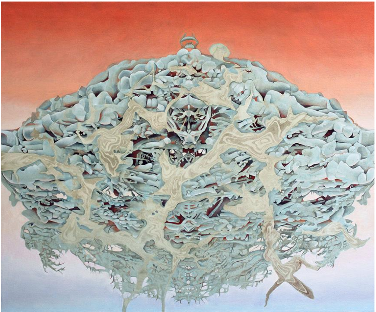
Natura Morta, 2015, Acrylic and Oil on paper, 22 x 30 inches

"I'm interested in symmetry as an ideal of perfection that can't actually exist in reality, the disconnect between the archetype and the actuality. My recent paintings are interior landscapes; abstractions of real or historical sites that become cognitive or emotional locations. Their symmetry indicates that they are illusory constructions." [Rebecca Bird]