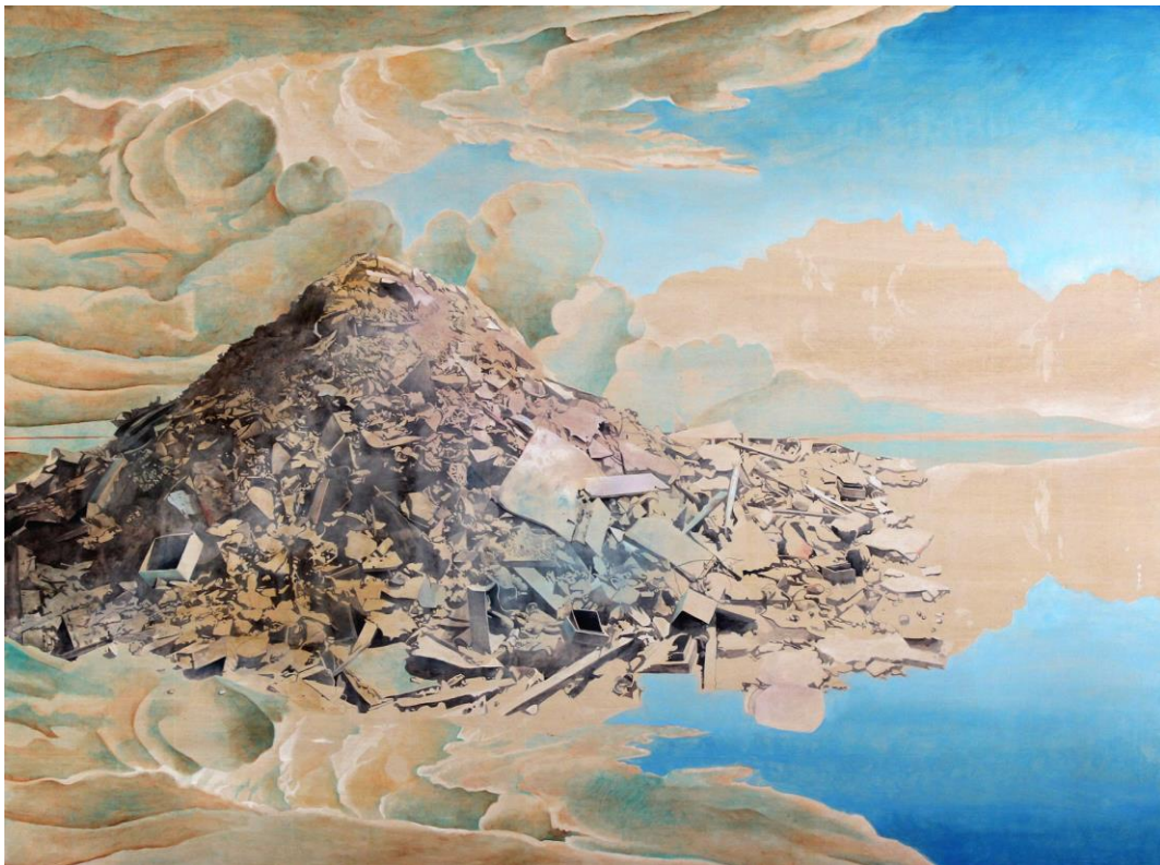
Flood, 2015, Acrylic and oil on panel, 30 x 40 inches

“The thing I find endlessly compelling about painting is that it’s a method of stopping time, or encoding it in material. An image of violent motion frozen makes that explicit.” [Rebecca Bird]