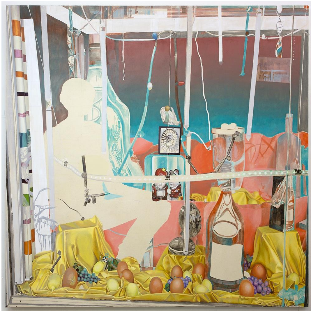
Sour Grapes, 2015, Oil and acrylic on canvas, 72 x 72 inches

Rebecca Bird's universe -whether depicted by pencil or watercolor on paper or by oil on canvas or panel- is a world of sensorial perceptions rooted in primary experience, in life memories and in an accurate observation of everyday life and nature. These are the point of departure for a personal re-elaboration of everyday subjects or landscapes, drawn or painted in an exquisite and almost hyper realistic manner. However, while linked to the everyday human experience, Rebecca Bird's works often digress into a surrealist dimension, the one of the subconscious, where no preconceived narrative is told and the viewer is directly engaged, being allowed to let the mind engage with the images.