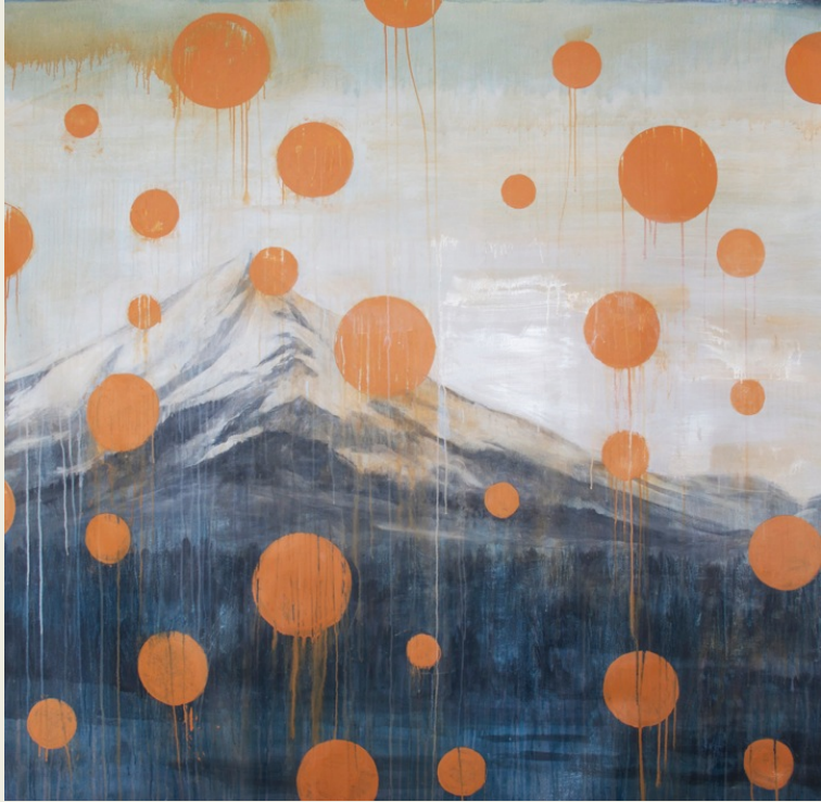
Mt. Shasta, 2015 Oil on canvas, 72 x 72 inches