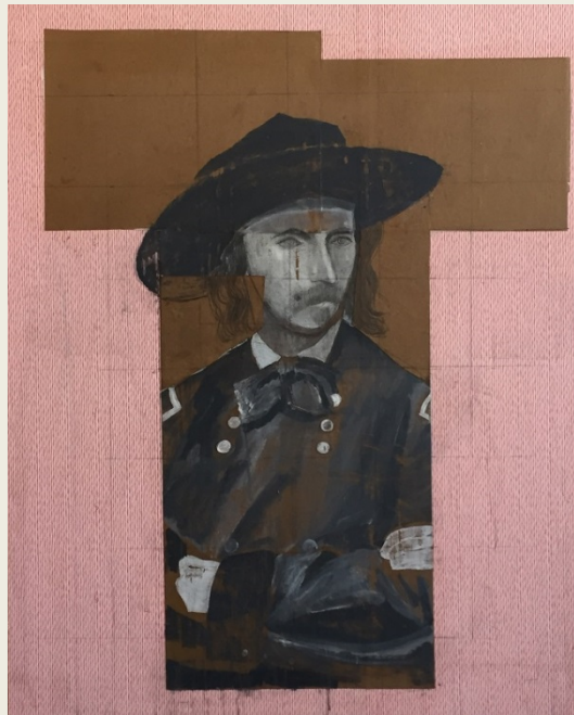
Custer, 2015 Acrylic and collage on panel, 40 x 32 inches