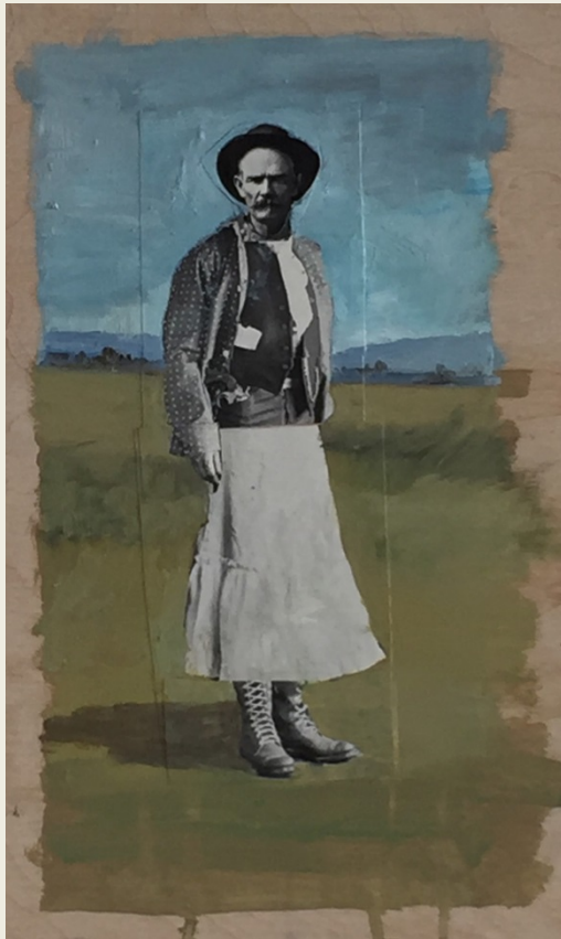
Marlboro Country , 2015 Acrylic and collage on panel, 14 x 8 inches