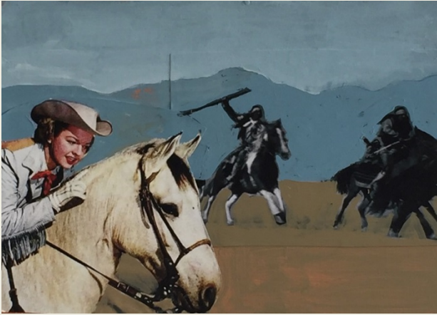
Dale Evans, 2015 Acrylic and collage on panel, 10 x 14 inches