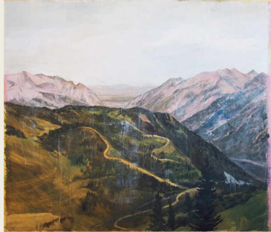
Little Cottonwood, 2015 Oil on canvas, 72 x 84 inches