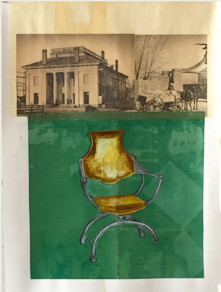
Planetarium, 2015 Mixed media on paper, 30 x 22 inches