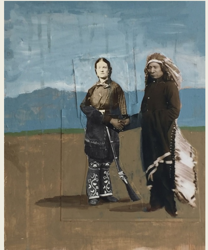
Handshake , 2015 Acrylic and collage on panel, 12 x 15 inches