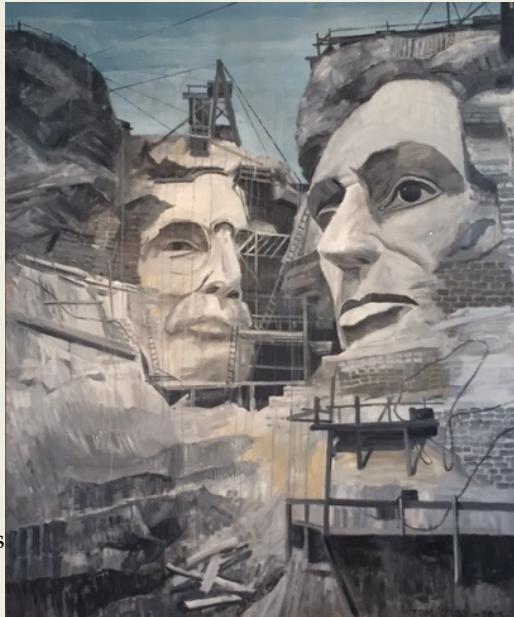
Mt. Rushmore, 2015 Oil on Canvas, 72 x 60 inches