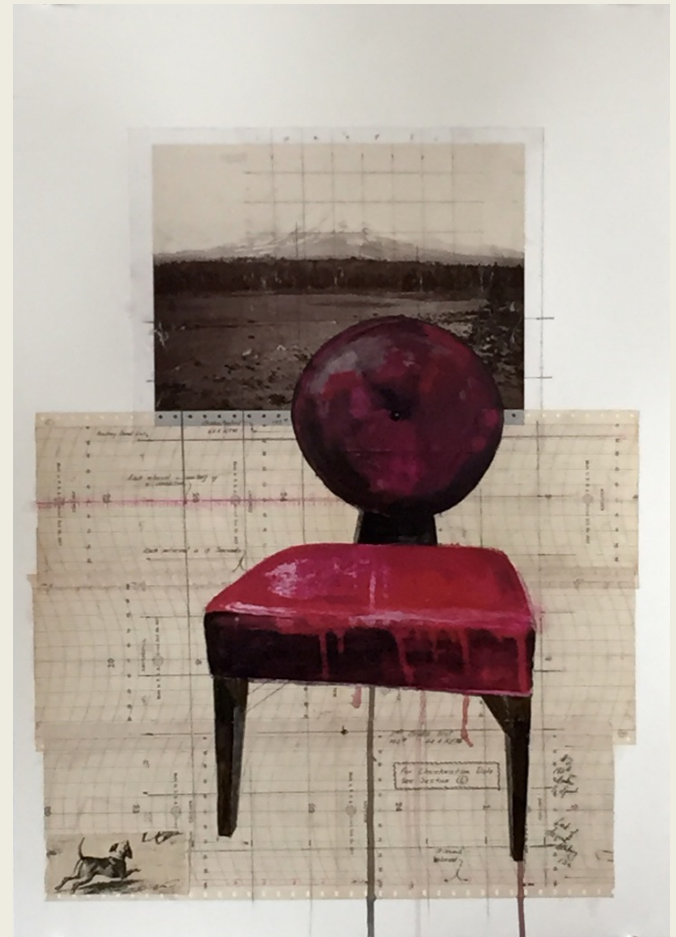
Devil Chair, 2015, Mixed media on paper, 32 x 20 inches