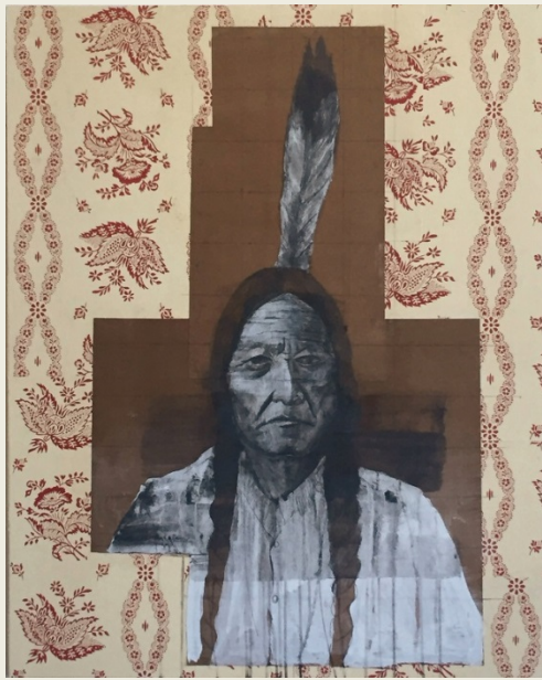
Sitting Bull, 2015 Acrylic and collage on panel, 40 x 32 inches