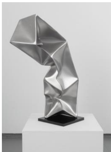
Triple (model) , 2014, 37.8 x 8 x 8 inches, stainless steel

The forms are welded and often polished to a satin or high gloss finish. Using a vacuum pump, Hilgemann then draws air out of the steel forms, creating an internal atmospheric pressure that collapses the steel into lyrical, dancing shapes. The resulting sculptures are a combination of careful planning and chance, possessing unique and unexpected qualities of random twists and creases, rendering steel into surprisingly delicate sculptural forms.