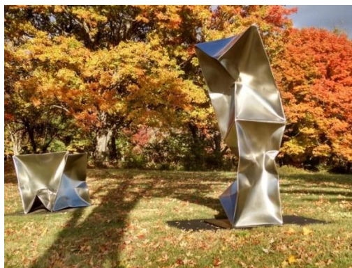
Imploded Cube and Double, 2012, 2013, 43 x 33 x 36 and 72 x 24 x 24, stainless steel

We will begin the season's program with a solo installation by the Amsterdam based German artist Ewerdt Hilgemann including four large works in a spectacular landscape setting and a group of four smaller works in our new gallery space. All works are sculptures of stainless steel made with the artists 'Implosions' technique. Two are studies for works featured in the 2014 Moments in a Stream Exhibition on the Park Avenue Mall sponsored by The Fund for Park Avenue Sculpture Committee and NYC Parks.