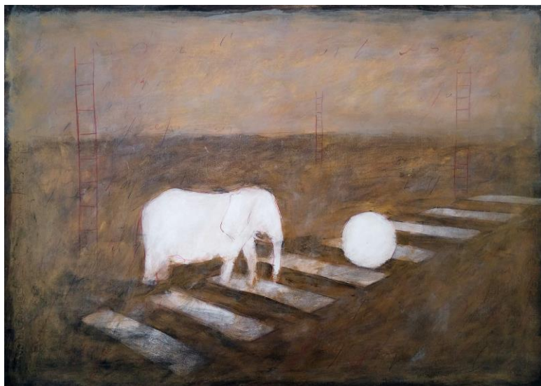
Traces of Memory VI , 2015, oil and golden powder on paper, 19.6 x 27.5 inches

Sometime the urban architecture disappears and in its place appear cows, elephants and or dolphins in unnatural situations. These animals play and move through space, on their Journey towards an unspecified location, in search of their destiny. In the end the Journey abandons the spatial and visual to become, increasingly, a mental experience: the Journey of the soul, images illustrating the questions of modern philosophy: Who are we? Where are we going?