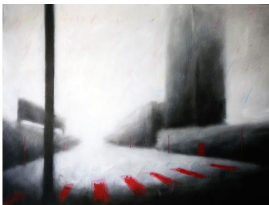
Migrant Cities , 2015, oil on canvas, 24 x 32 inches

These series have been exhibited extensively in various countries including Italy, France, Spain, Thailand, Singapore, Argentina, Malaysia, China and the United States, and they arise from Morales' fascination with the complex mechanisms of human recollection and search for identity.